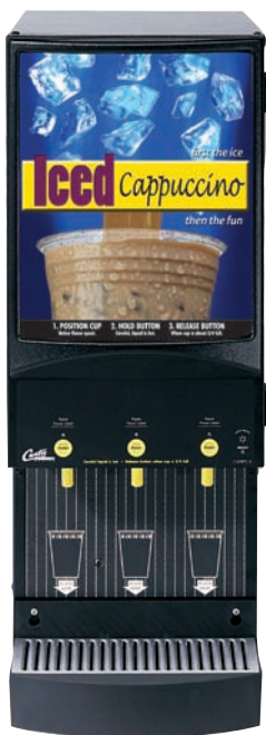
CAFE PC3 ICED CAPPUCCINO