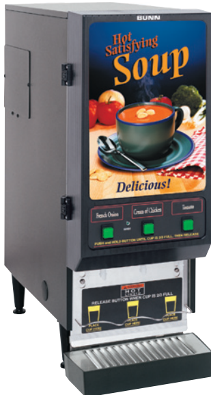
FMDS-3 front display panel

Dimensions: 30"H x 11.3"W x 23.3"D (76.2 cm H x 28.7 cm W x 59.2 cm D)