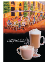
Model FMD-3 available with optional Cafe Display

Dimensions: 30"H x 11.3"W x 23.3"D (76.2 cm H x 28.7 cm W x 59.2 cm D)